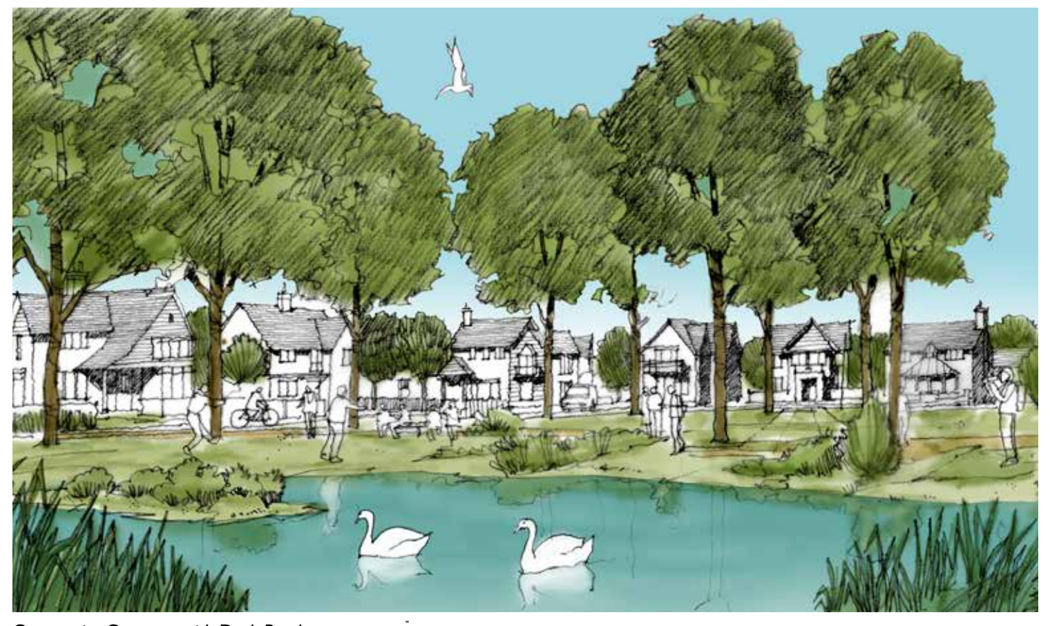
Community Common with Duck Pond