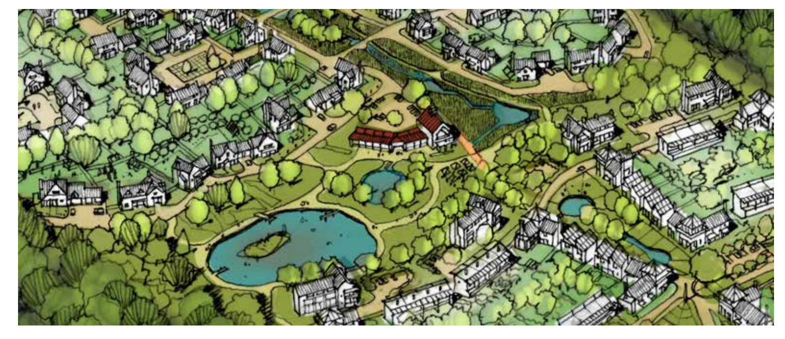
Community Common with Duck Pond and Woodland Centre Community Building