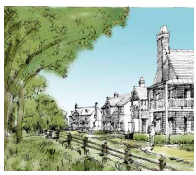
Forest Hamlet Woodland Fringe