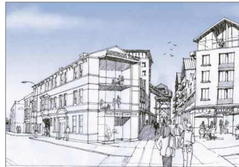
View of Medina Road Square