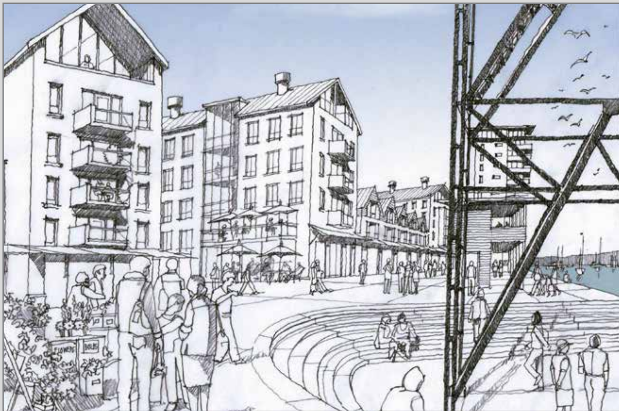
View of Hammerhead Square