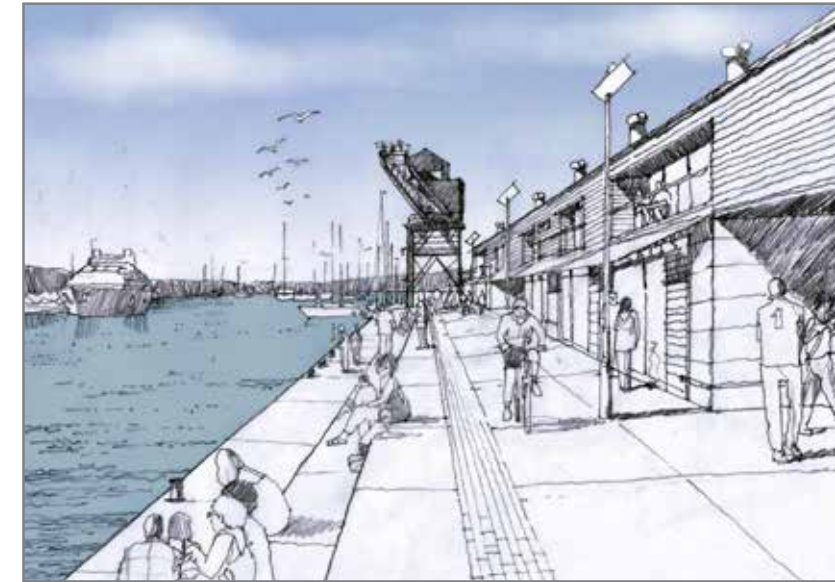
View of Lower Promenade