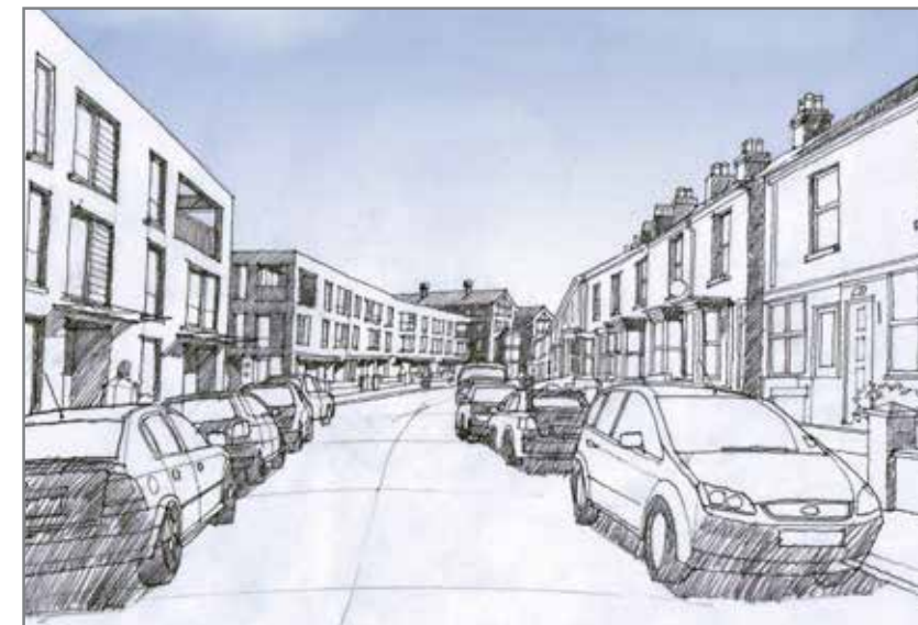
View of Thetis Road