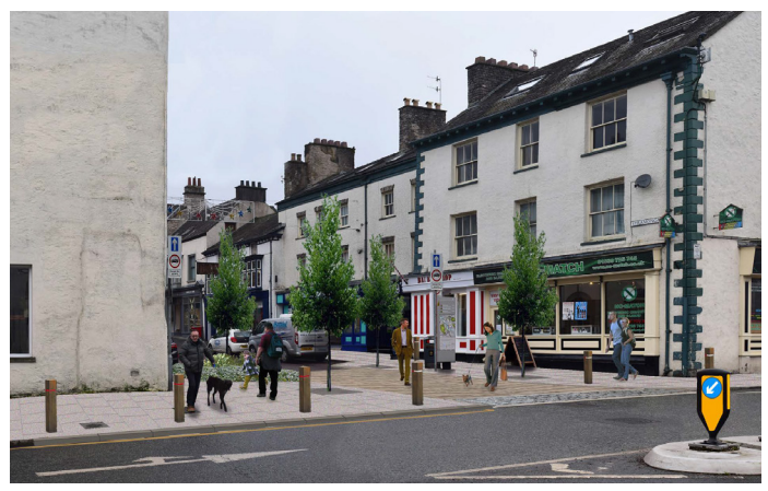
Artist's impression illustrating the new continuous footpath junction proposal.

With the opening of the new Gooseholme bridge in summer 2022, access from New Road by pedestrians and cyclists is likely to increase the number of people passing through this junction at Stramongate and Blackhall Road. To facilitate the increase in visitor footfall to Stramongate with the opening of the new Gooseholme bridge, a proposed new raised footpath across the mouth of the junction will prioritise the junction for pedestrians (image 5). Planting and trees will reduce traffic noise and air pollution from Blackhall Road for a more pleasant shopping and visitor environment on Stramongate.