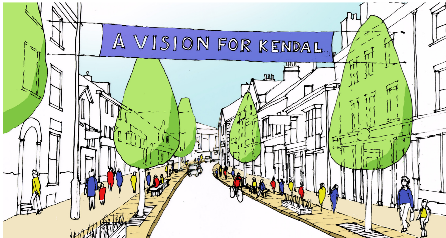
The transformation of Stramongate prioritises people and socialising and is softened by large trees contrasting the "Auld Grey Town". Caption

The Vision for Kendal Community Participation Weekend is being facilitated by Farrer Huxley and JTP on behalf of Kendal Futures. For more information please visit: jtp.co.uk/projects/Kendal or contact the JTP Community Planning team: community@jtp.co.uk | Freephone 0800 0126730.