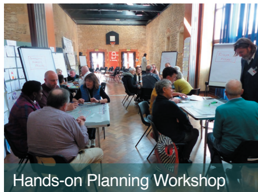
Hands-on Planning Workshop