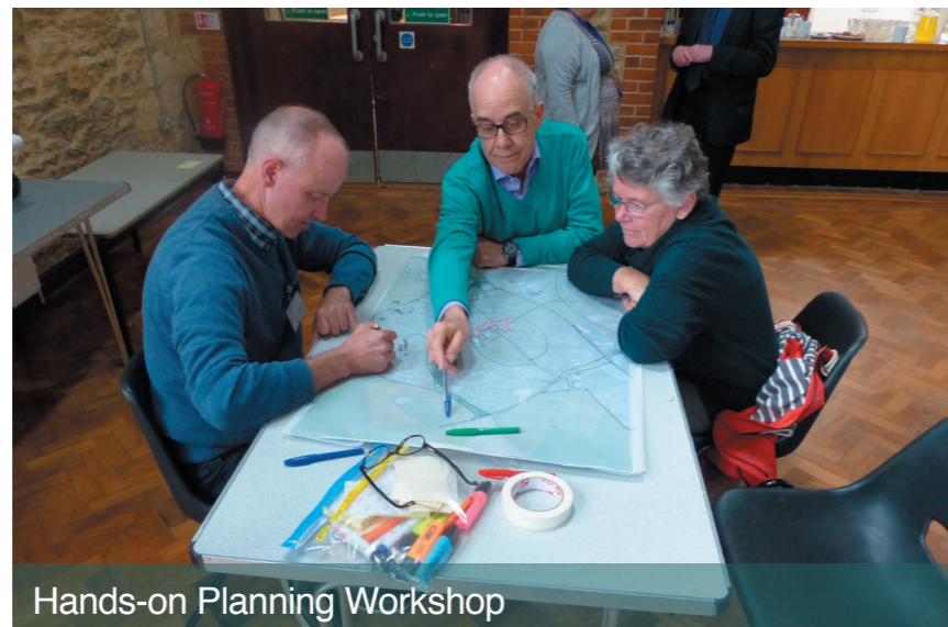
Hands-on Planning Workshop