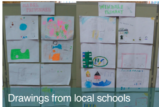
Drawings from local schools