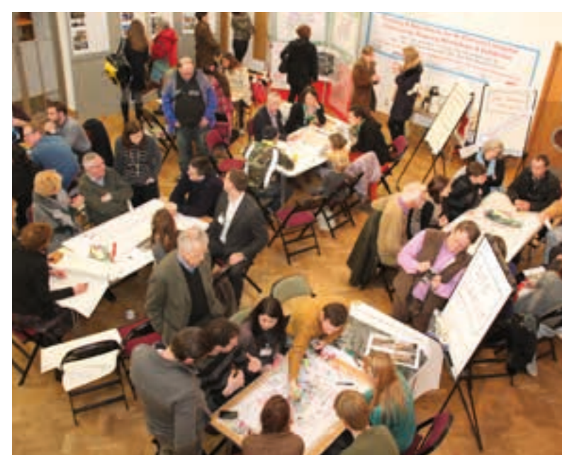
Hands-on Planning Workshop