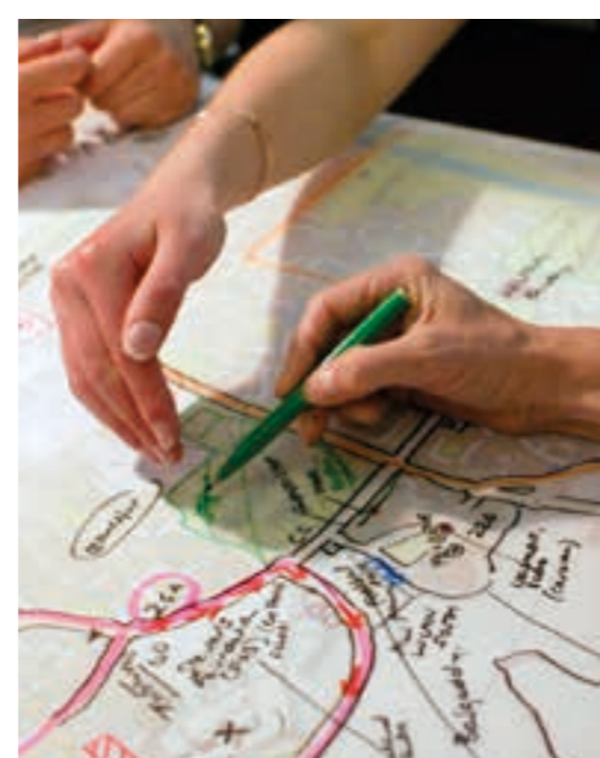
Hands-on Planning Workshop