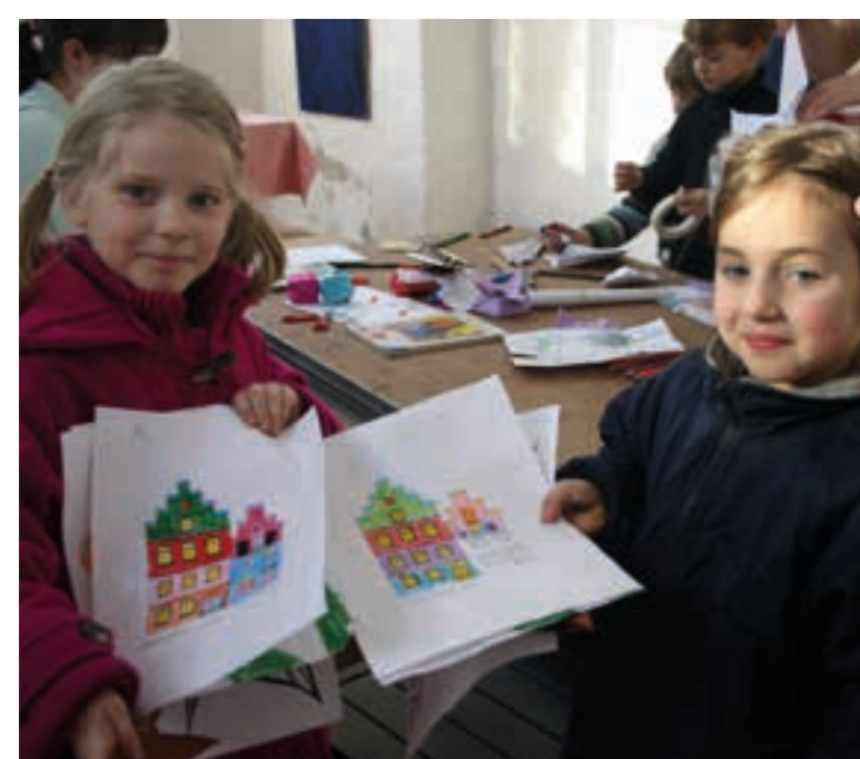
Young People's Workshop

The new Vision and Charter will describe and illustrate the future of Maidenhead Town Centre and inform developers about the expectations and aspirations of the community. It will also help guide a number of other future areas of work, including the future transport and parking strategies and public realm design standards.