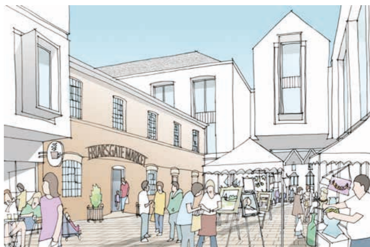
Central Winchester Regeneration