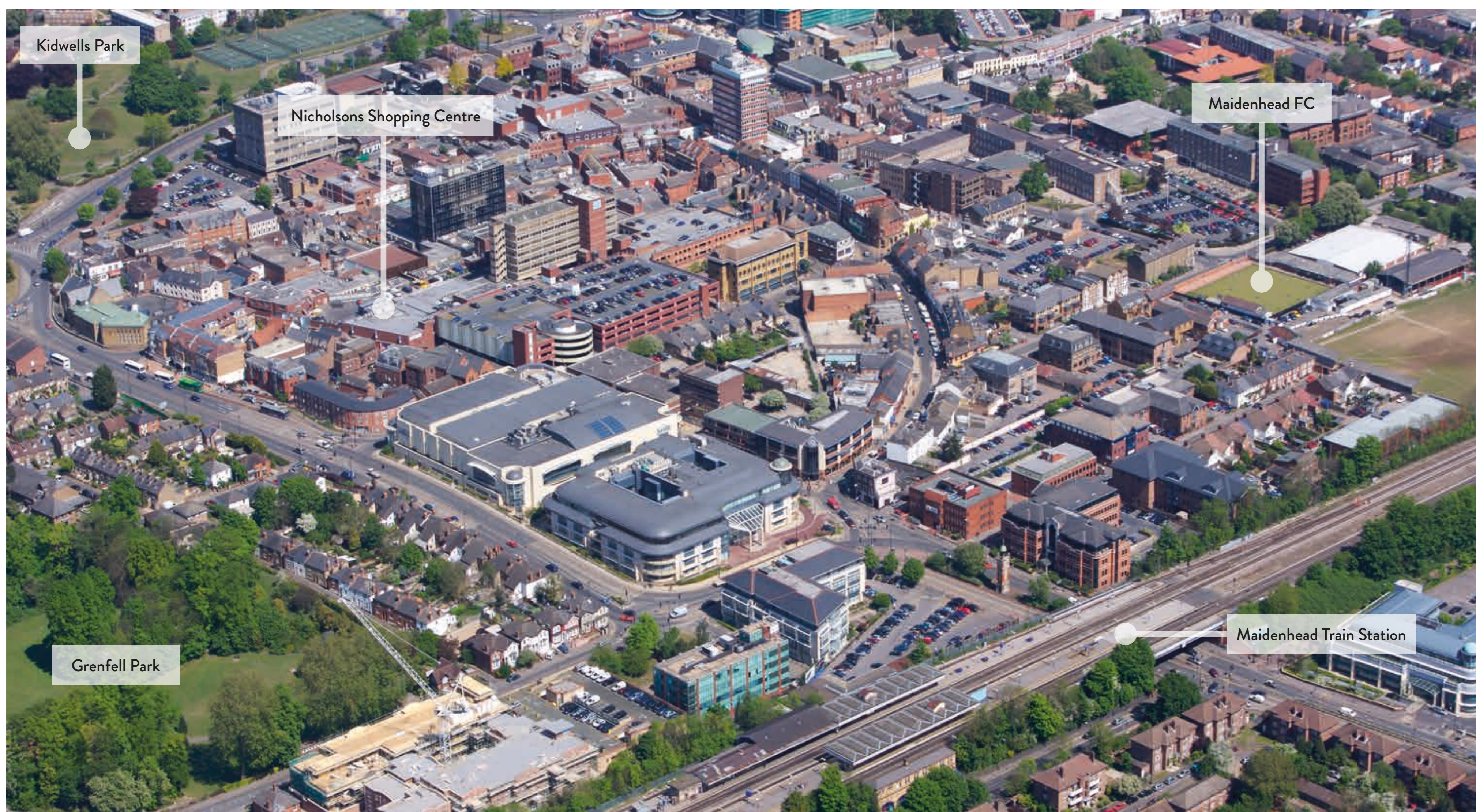
Aerial View from South West