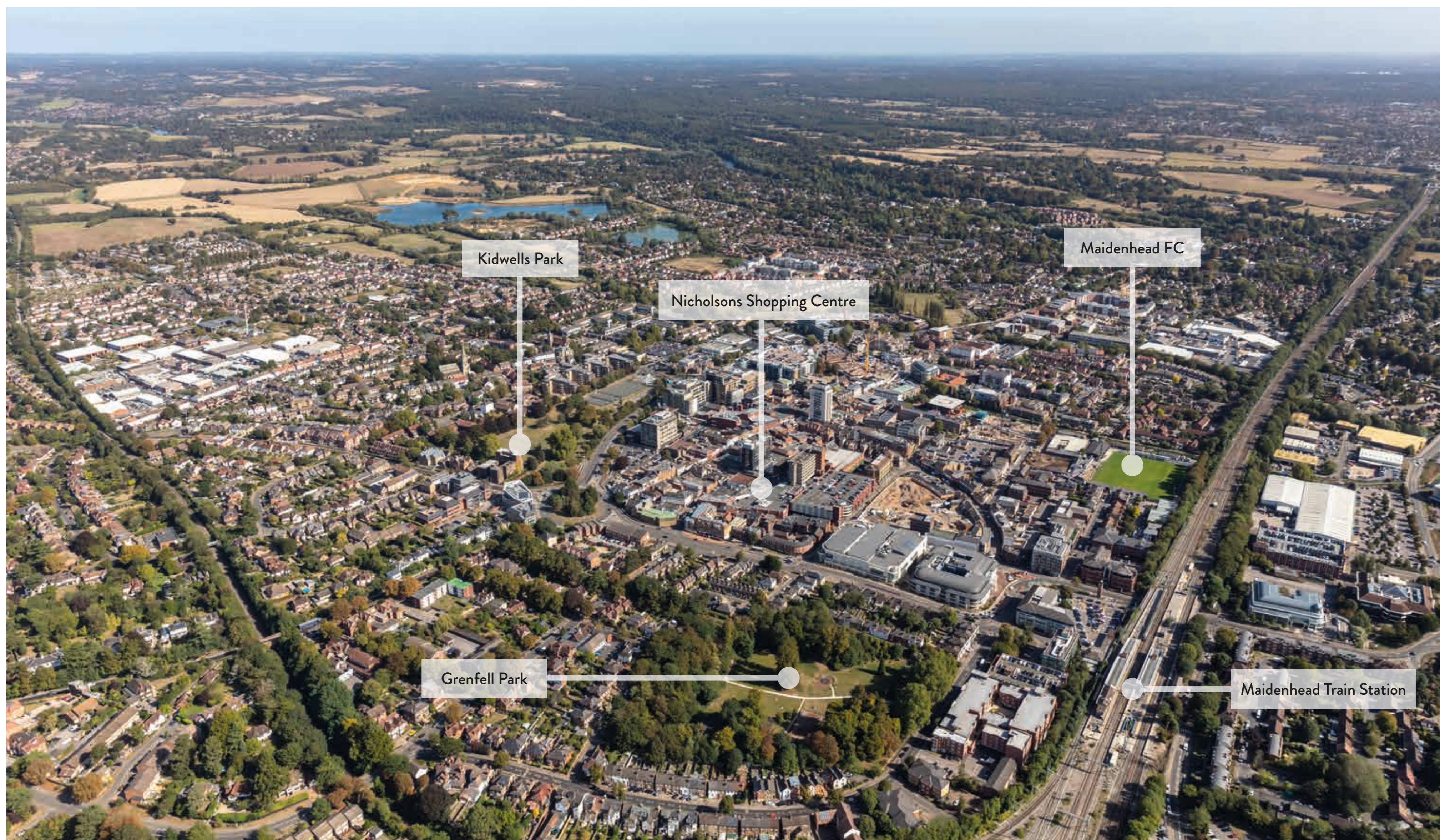
Aerial View from South West