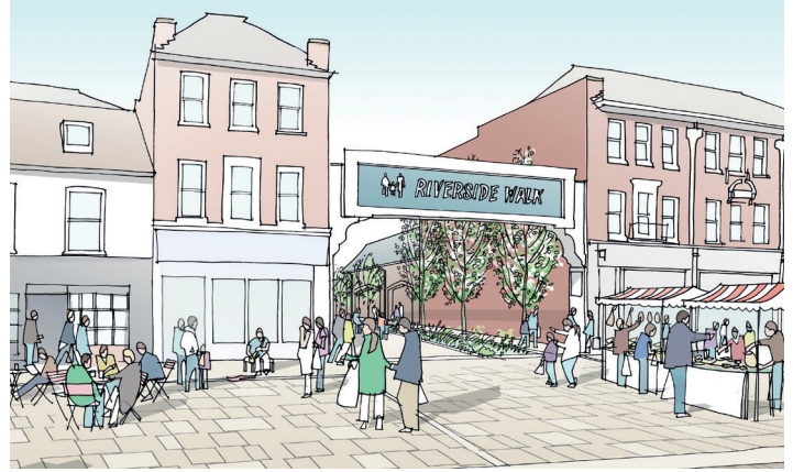
Riverside Walk from the Broadway (artist's impression)