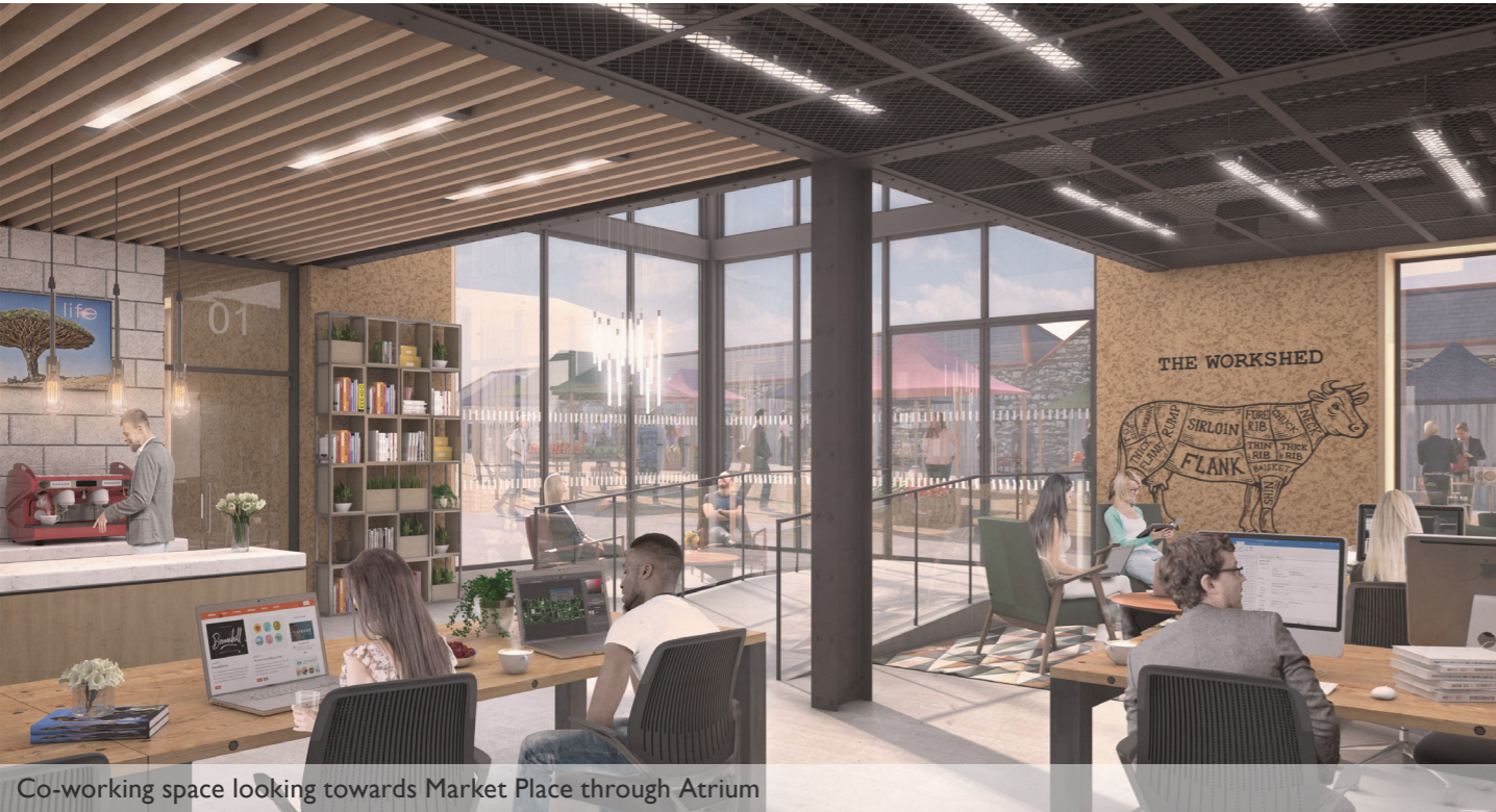
Co-working space looking towards Market Place through Atrium