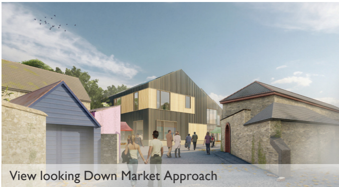
View looking Down Market Approach