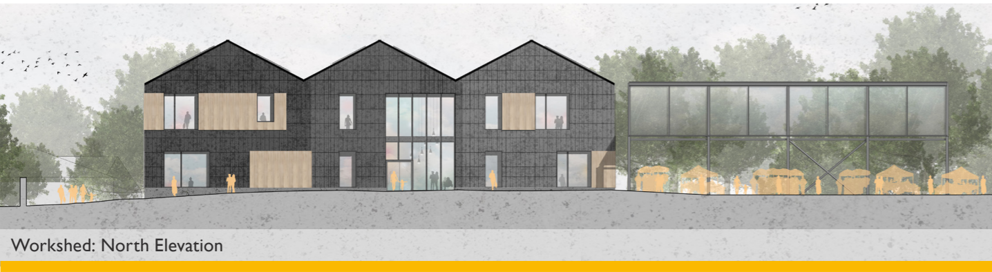
Workshed: North Elevation