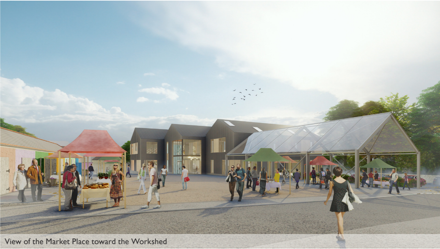
View of the Market Place toward the Workshed

In December 2017 the final livestock sale was held at Liskeard Cattle Market creating an opportunity to rethink the future of this key area in the heart of the town.