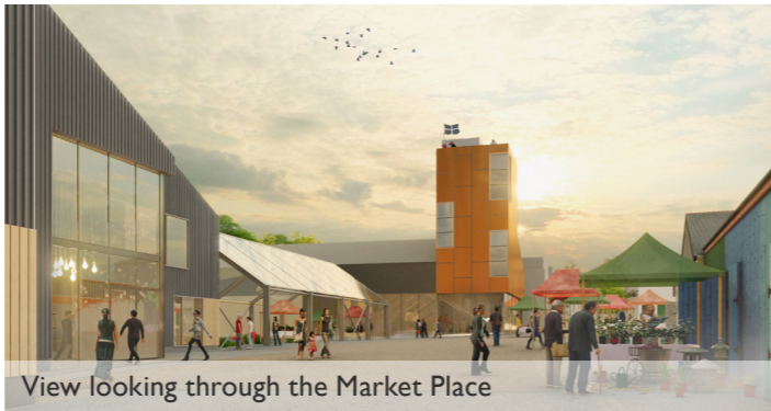
View looking through the Market Place