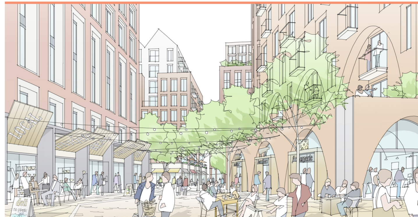
Hops Walk - a new pedestrian route connecting King Street and Queen Street via Brewery Square