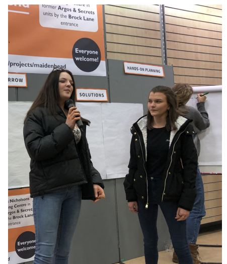
Images from the Community Planning Weekend, 22 - 26 March 2019