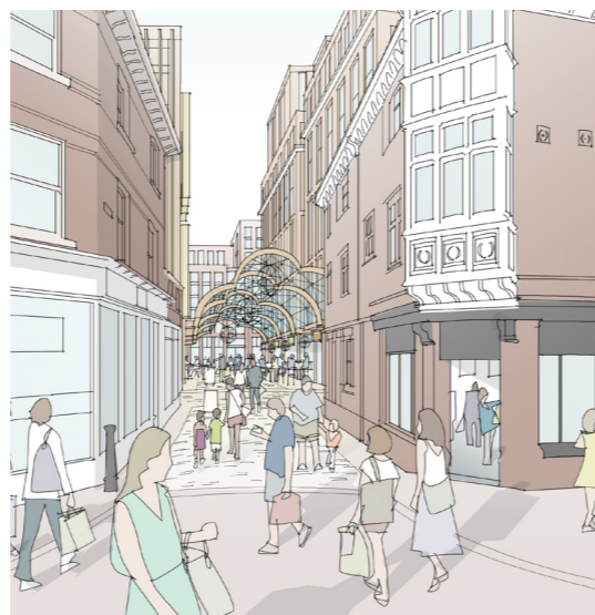
Brock Lane - a new route connecting Queen Street and King Street via Brewery Square