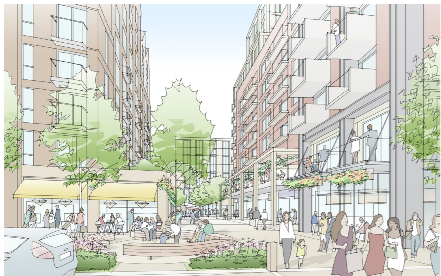
The Rill - a new route connecting The Broadway to the High Street via Brewery Square