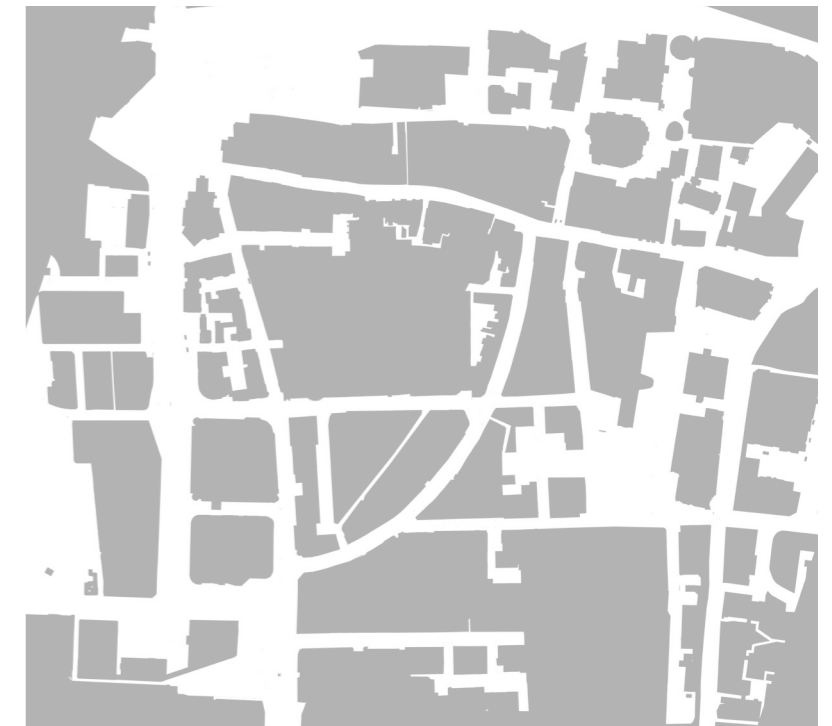
Existing noll plan - shopping centre closed