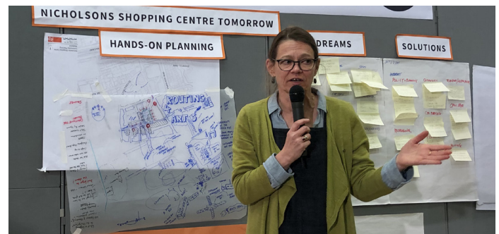
Community Planning Weekend, 22 - 26 March 2019

“There must be a fair process – where all groups can have their say.”