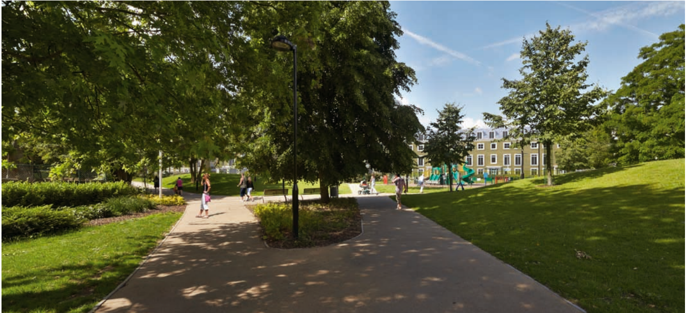
4. Summer view from Frank Banfield Park 'Redefining the park edge and creating a clear route to the river'