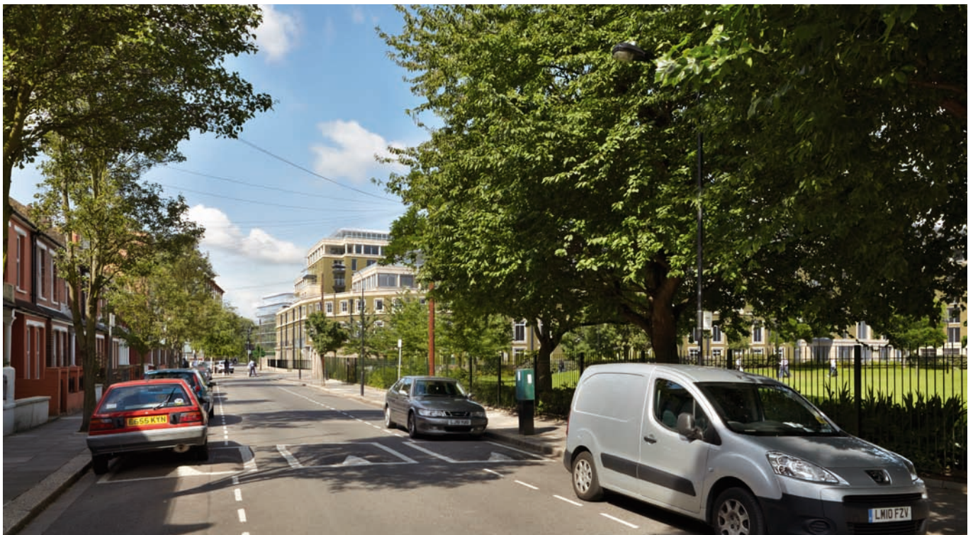
5. Summer view from Winslow Road 'Respecting the adjoining houses and following the sweep of Distillery Road'

Further images are available from www.fulhamreach.co.uk