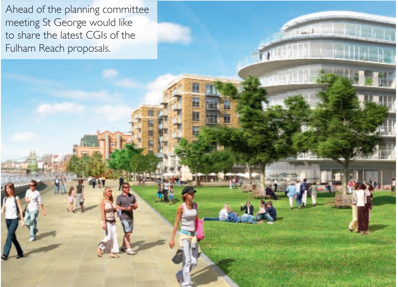
1. View along new Thames Path 'Creating a new public riverside park'

Ahead of the planning committee meeting St George would like to share the latest CGIs of the Fulham Reach proposals.