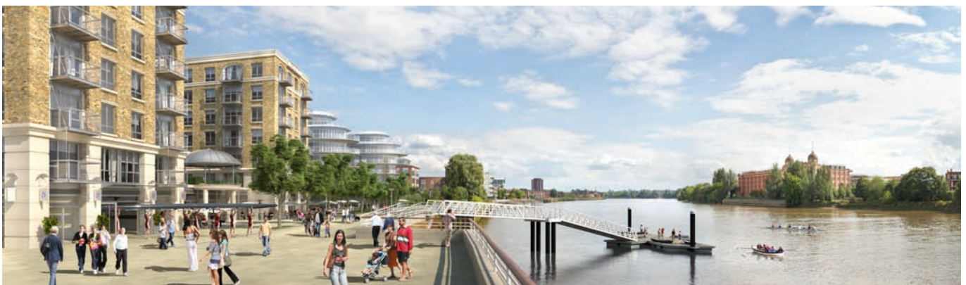
2. View along riverside walk 'Vibrant riverside environment, promoting use of the water'