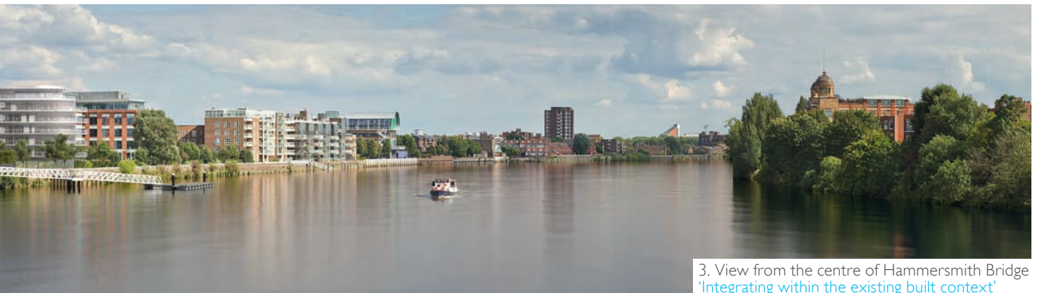
3. View from the centre of Hammersmith Bridge 'Integrating within the existing built context'