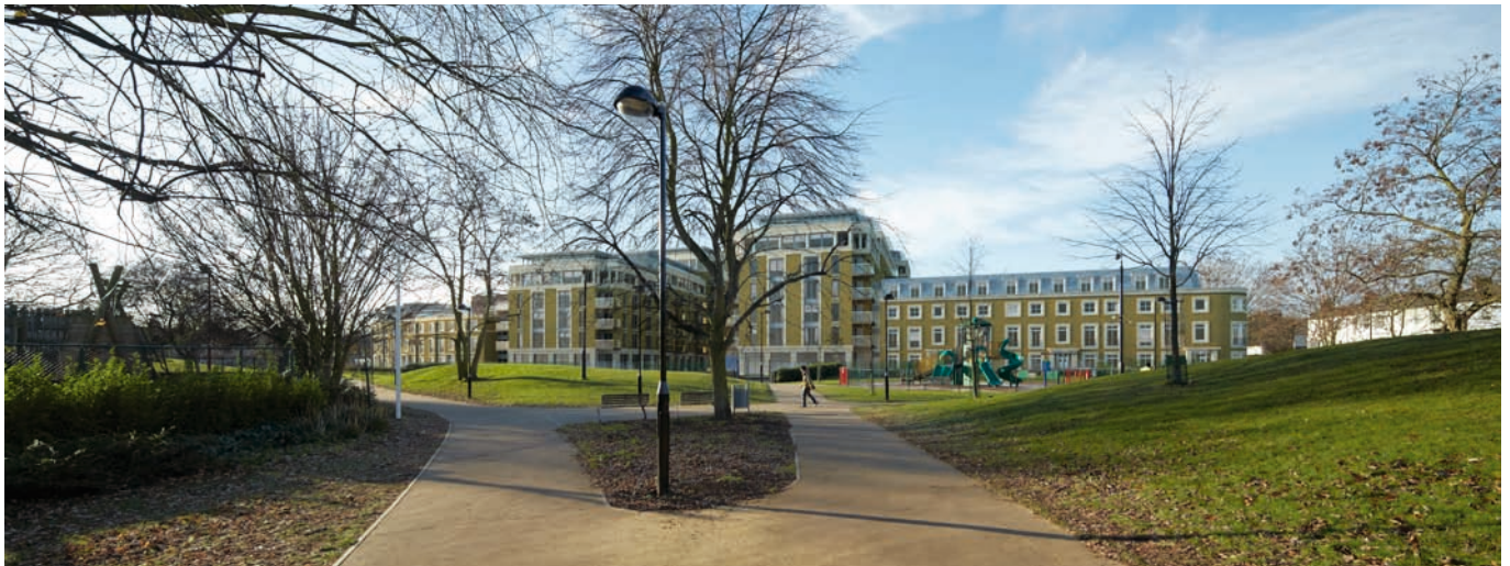
VIEW 7 View from from Frank Banfield Park