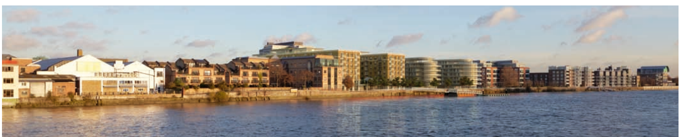
VIEW 9 From Hammersmith Bridge showing Fulham Reach in context