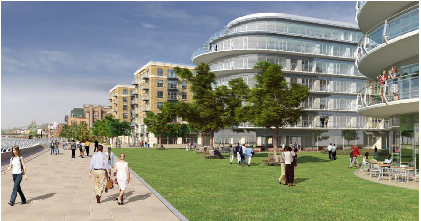
View 1 along the new river path towards Block A

Welcome to the third update newsletter on Fulham Reach from St George. This newsletter provides an update on our development proposals. We are grateful for your continued interest and involvement in the evolution of Fulham Reach.