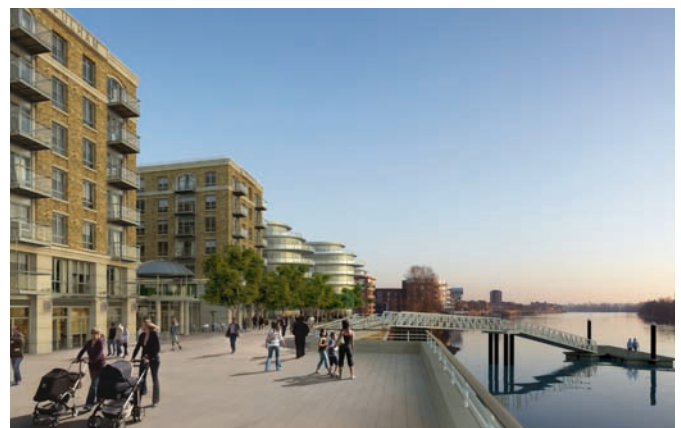
View 8 along the new river path towards Blocks G & H

The Fulham Reach site has been identified by Thames Water as a possible location for the construction of the Thames Tunnel. Following the first round of consultation Thames Water have indicated that the site is no longer needed to facilitate the construction of the main tunnel but it is still necessary to connect the pumping station to the main tunnel. This means that a much smaller site is required for a shorter period of time and the works can be accommodated on the Fulham Reach site. Phase two of the consultation process is due to be held in autumn 2011. Discussions are ongoing with Thames Water to enable both projects to proceed concurrently whilst minimising any potential impacts on existing and future residents.