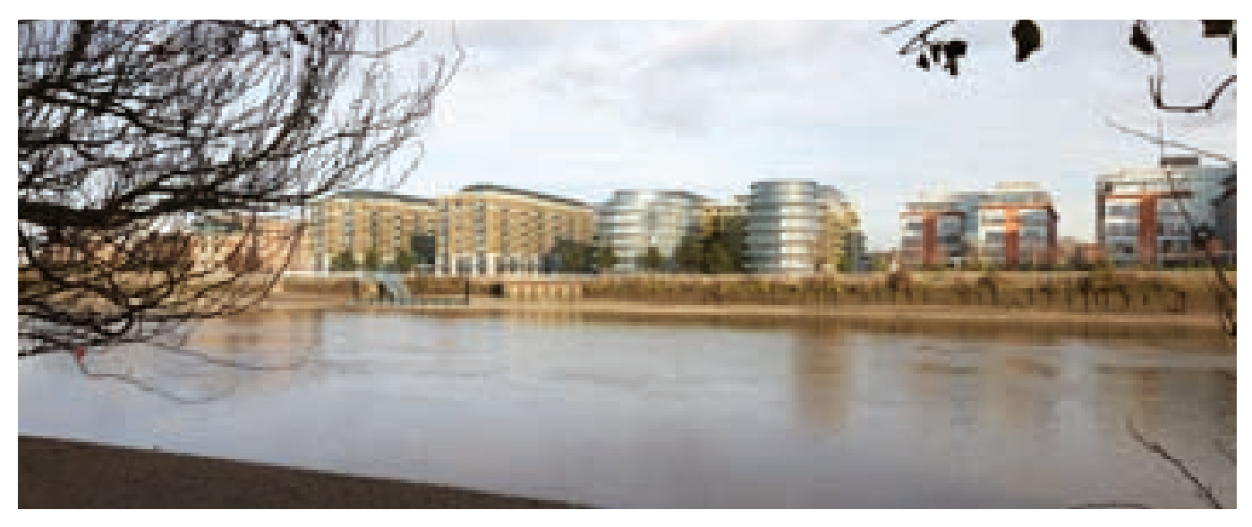
VIEW 2 View from south riverbank