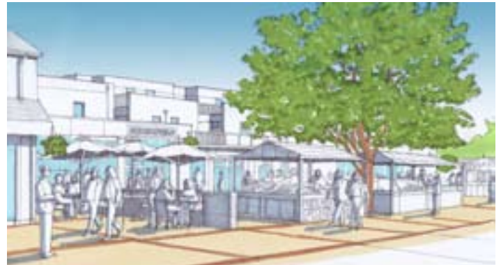
Wick Street environmental improvements

Weekend participants enjoyed the Community Planning process and were generally positive about new development opportunities, provided they are sensible, well designed and, in particular, bring about community benefits. Key stakeholders and landowners will continue to work closely to coordinate an integrated programme and deliver a common agenda for the regeneration of North Littlehampton. It is also important that local people remain involved in the process and are kept informed through regular meetings and communications. A new North Littlehampton Community Forum is proposed as an open public meeting, to ensure that the community can regularly participate in and discuss the regeneration proposals as they develop. The first meeting of this Forum will be in All Saints Church Church, Wick Street at 6pm for a 6.30pm start on Wednesday 17 September.