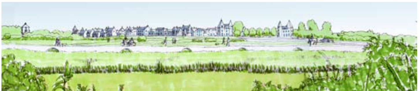
Northern gateway view