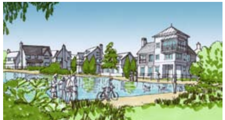
Housing around lagoon