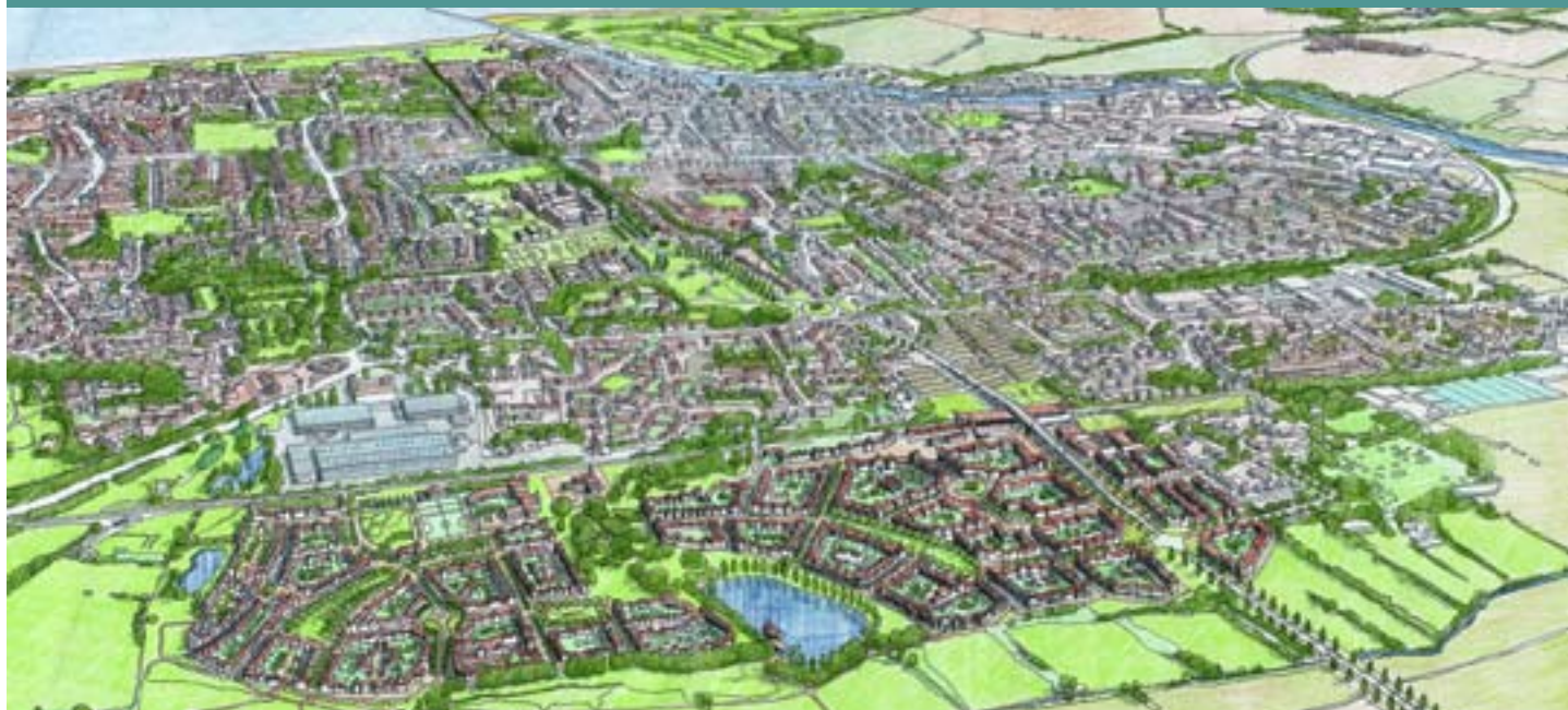
Aerial view of North Littlehampton in context