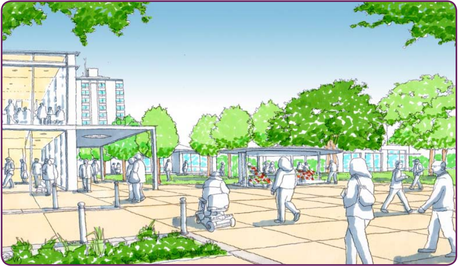
View across Central Parade to new supermarket and community facilities.