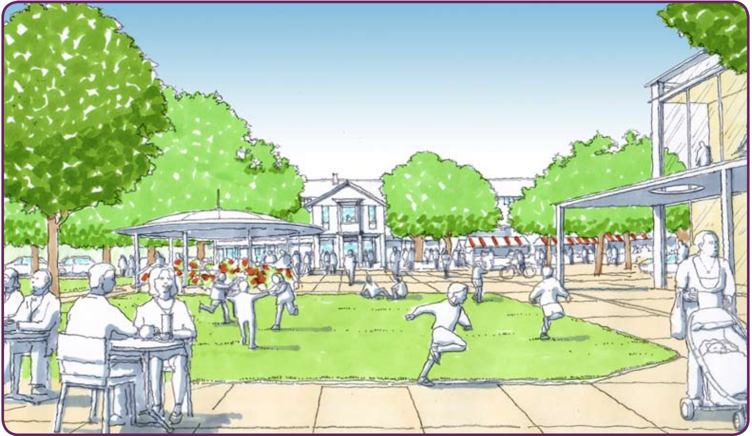
View of new Market Building across Village Green.