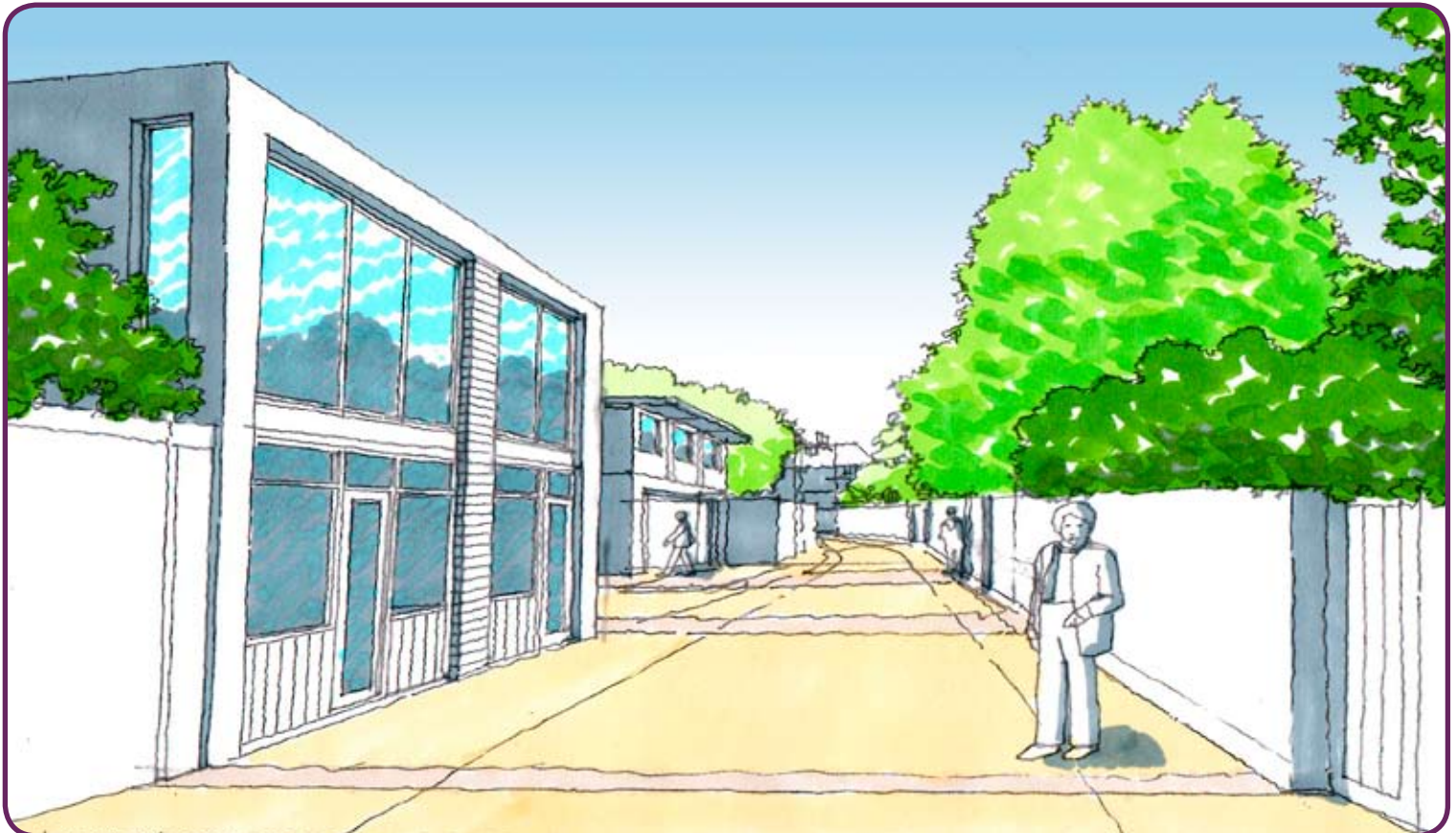
View of employment uses in access road to rear of Central Parade shops.

The views on this page are artist's impressions of how the proposals incorporated within the Vision for Central Parade might look.