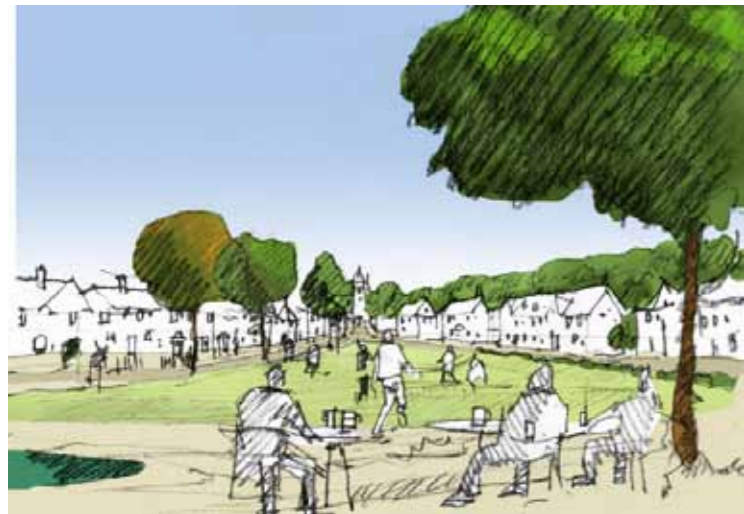
A Vision for a new Mid Green close to existing village centre