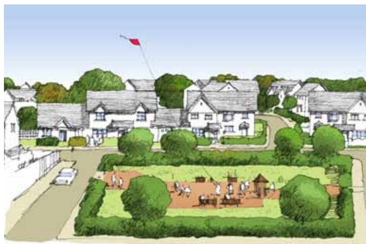
A typical hamlet centre showing green open space