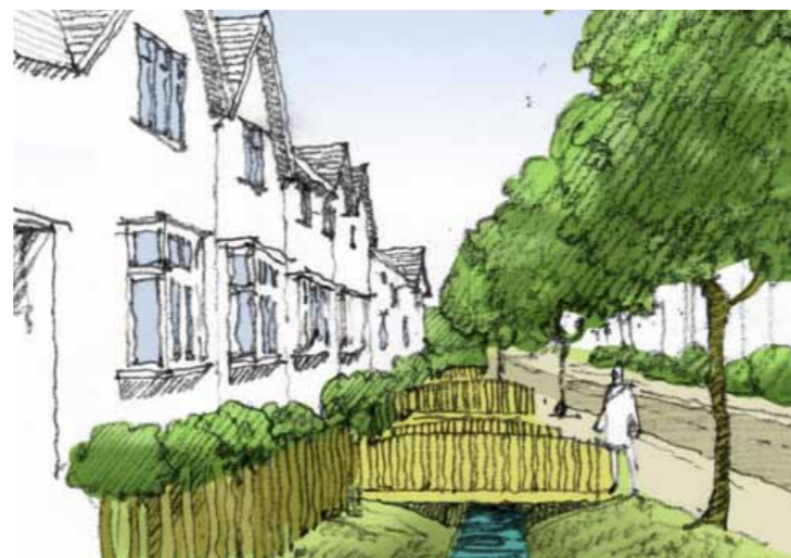
A Vision for a typical residential street