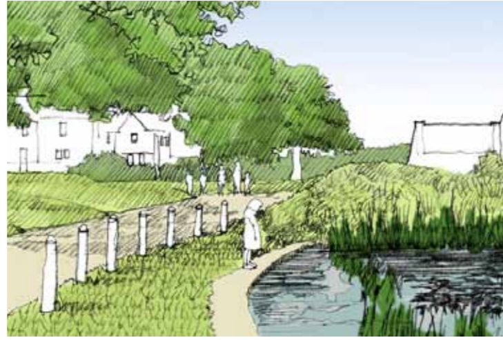
A Vision for a new wetland area within green wedge