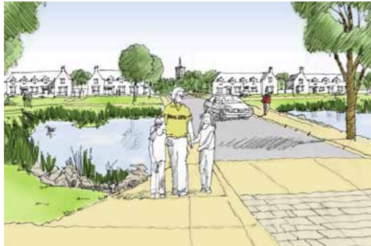
A Vision for a new South Green at Norwich Road

The following illustrations were drawn up during the Community Planning Weekend