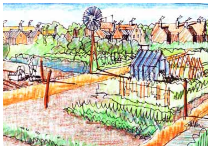
Allotments within green buffer zone to existing village